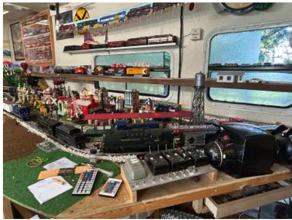
OF COURSE WE RAN THE TRAINS!