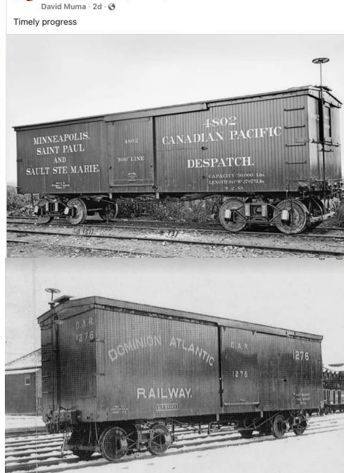
some early Canadian freight cars for the modeller

Here is a completed and ready to assemble 3D PRINTED KIT of a 36' Wood Sided Postal Car.