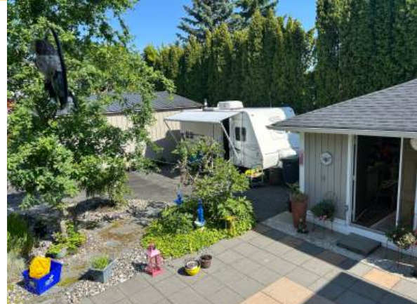
CHECKING OUT ED'S 'LAYOUT IN A TRAILER' IN COQUITLAM, BC.