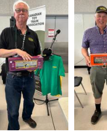
May Door Prize Winners