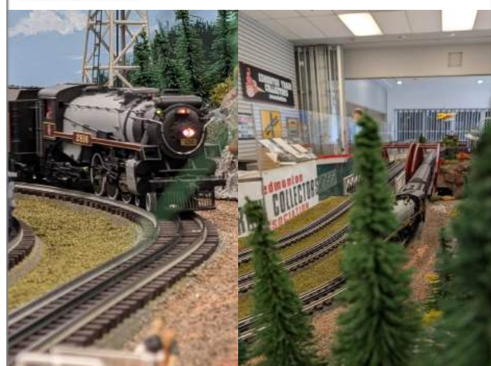
love to see more pictures of the layout too.

Saturday Running session at @ Edmonton Train Collectors Association. Bit of royalty on the layout! New to me, so needs to be taken in for some touch ups and a board replacement