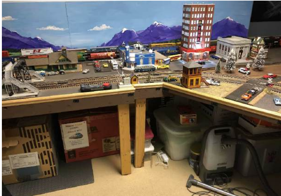
Attachment point Velcro strips now in place along table frame.

Do you see something like this when running your trains?