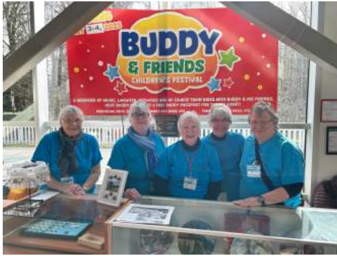
Part 3: around the RMBC