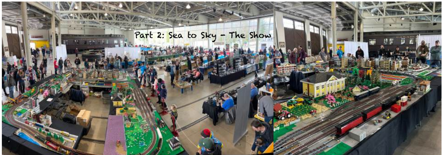
Layouts, hobby clubs, associations and dealers all gathered among the big trains