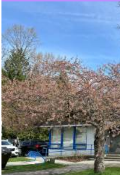
April Prize Winners -->