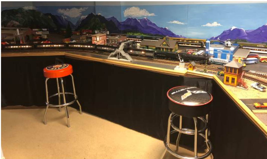
Detachable table skirts cut to fit now in place along layout frame.

Adding a table skirt makes running trains a lot more enjoyable!