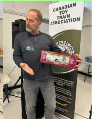
November Door Prize Winners