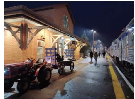
Toronto to Georgian Bay, up past Sudbury with a snowy stop in Capreol on day one.