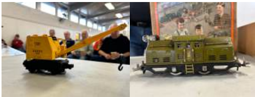
Another meeting with great attendance and plenty of train action.