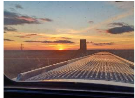
Day three: sunrise and sunset from the glorious dome car, with scenic stops waiting for freight trains.