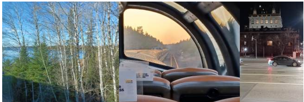
Day two: Joys of the observation car in the north woods, a cool sunset and late into Winnipeg.