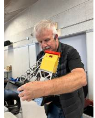
Door Prizes, Auction Surprises, and a couple of show 'n tell's