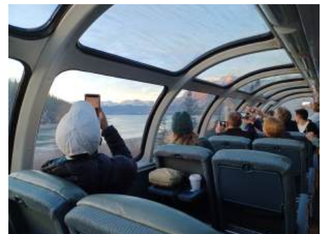
Day four: sunrise in north Alberta and the first sight of mountains...