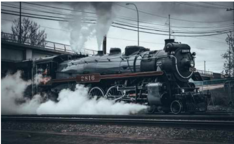
Leaving Calgary — great overcast photo on 'Fans of the CPKC Empress 2816'