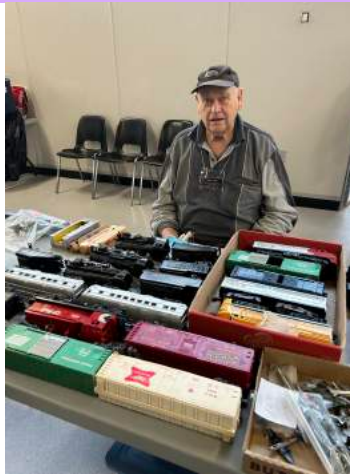
January meeting and door prize winners