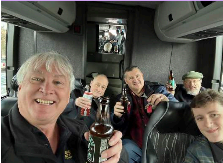
And on the way home...