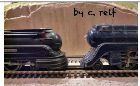
Prewar Lionel - Postwar Sakai