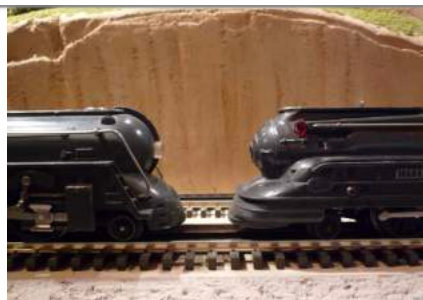
Postwar Brother - Prewar Brother