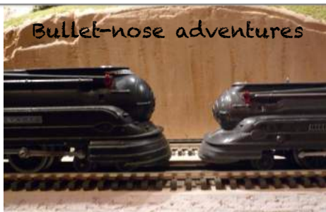
Prewar: Big Brother - Little Brother