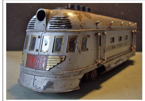
Table Sales, Displays, Show and Tell, Door Prizes, Refreshments. Bring Trains to Sell!!

Not your grandfather's Flying Yankee! this one was made in Japan in the 1930's