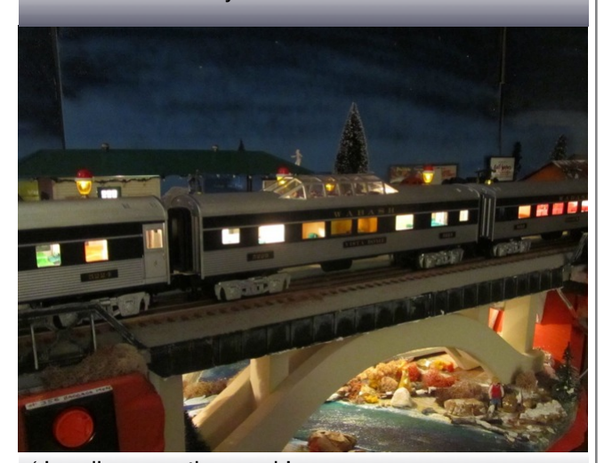
'Loading over the creek' {night scenes on the eli bryan nelson layout}