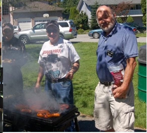
JUNE BBQ - YEAH!