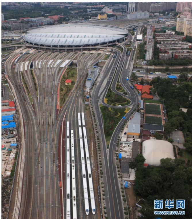
Beijing to Shanghai high speed trains, at the Beijing terminal.