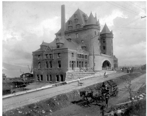
first Vancouver Station under construction, 1889