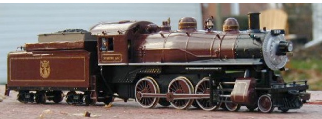
Dominion Atlantic 10-wheelers