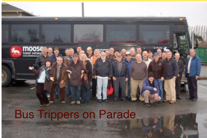
Bus Trippers on Parade