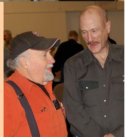
HO, OO and oh how tiny trains join big trains at the January meeting