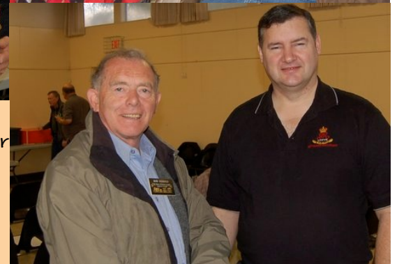
January door prize winners (above)