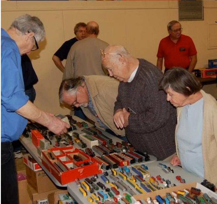
Good Company and good fun at the January meeting (above right)