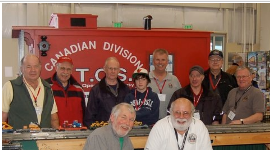
The crew at Monroe with the modular layout and soon to be re-lettered CTTA caboos. Looks like fun.

EDITOR'S CORNER: THANKS TO PETER FOR THE GREAT PIX, AND TO JAMES COOK FOR THE LCCA/LIONEL FACTORY ITEM.