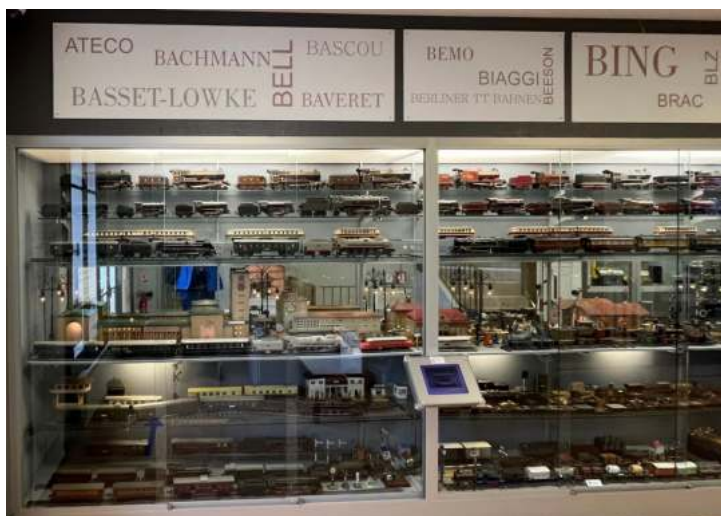
a "who's who" of historic European toy trains

Both venues made for interesting footnotes on a great vacation.