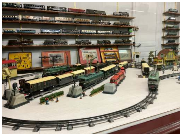
Jep trains on display — classy French tinplate