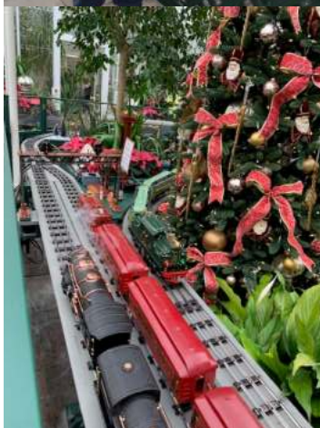
Lots of action on the holiday display in the Conservatory at Volunteer Park in Seattle.