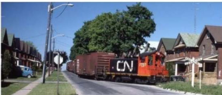
Yes in Canada - you can have a freight train lumber down your street, and stop at your porch.