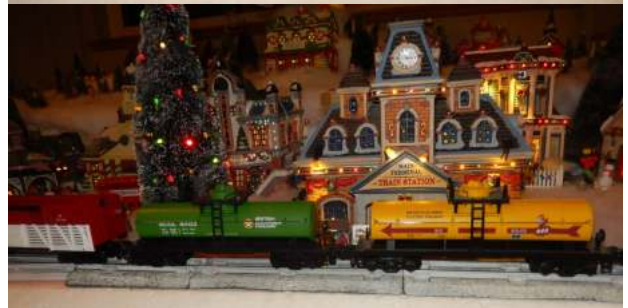
Martin & Leona Howbold's Christmas tree S-gauge layout, with the exotic BCE tank car.