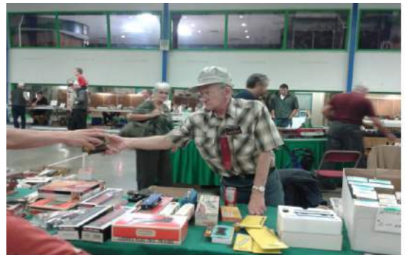
Westshore Recreation Centre September 2013