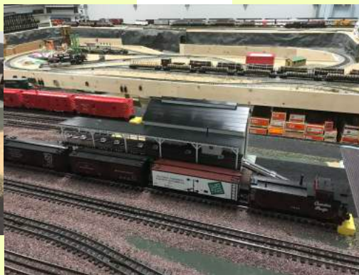
CTTA club reefers put to work.