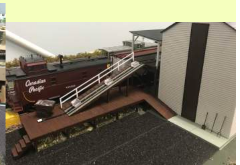
tools and cart included.

James says: the Ice House and Platform kits are sold separately. Great drawings but not so great written instructions, so you have to follow the drawings carefully, and carefully cut loose the fine detail pieces of the platform. James added some detailing, It looks amazing.