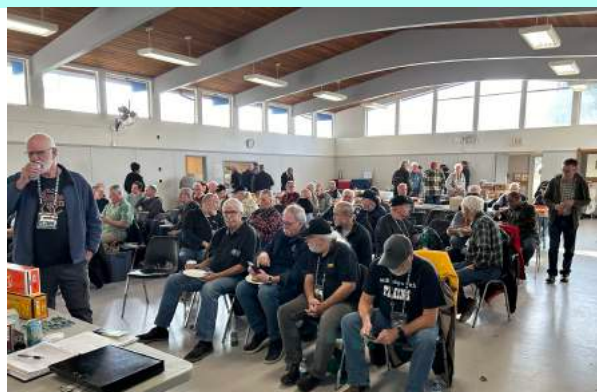
Great attendance: about 70 members &amp; guests