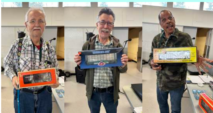
November Door Prize Winners