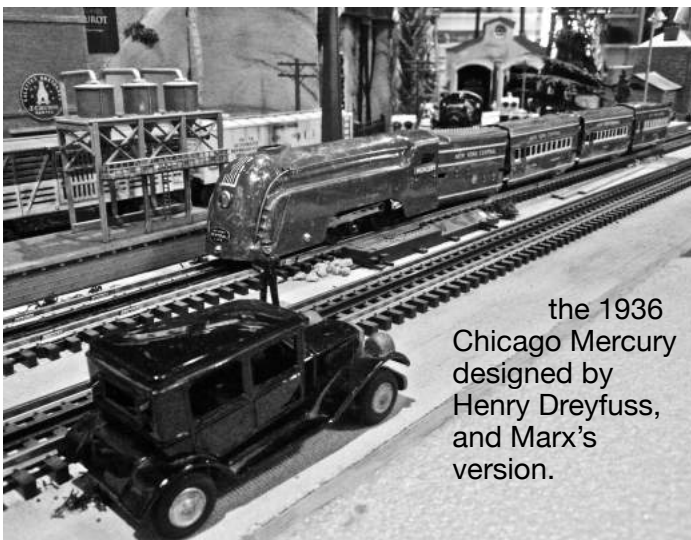
the 1936 Chicago Mercury designed by Henry Dreyfuss, and Marx's version.