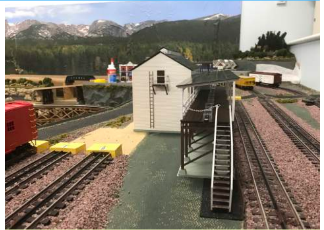
End view, James added the 'worksafe' chain.