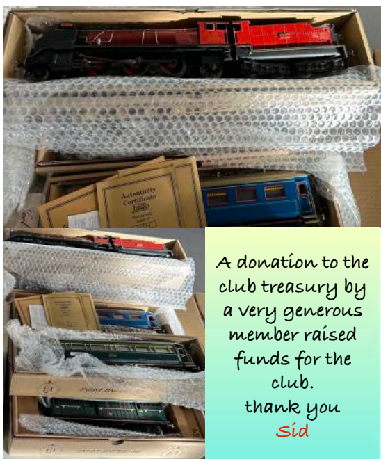
A donation to the club treasury by a very generous member raised funds for the club. thank you Sid