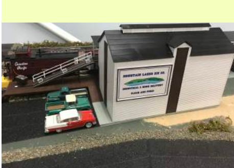
Back view with the workers' cars.