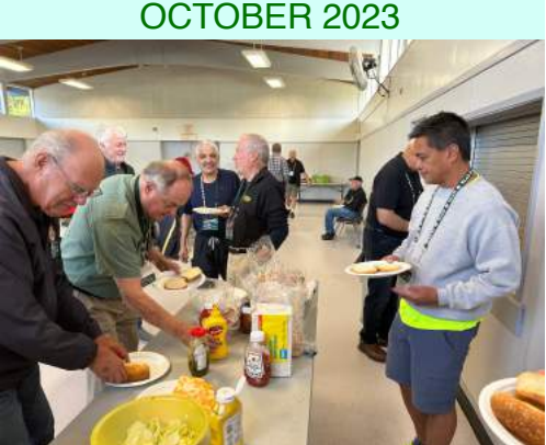
cheers to the BBQ crew, from all the eaters!