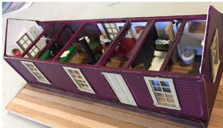
Yale Portable Station – featured in the May 2017 issue.

Eventually his enthusiasm for HO was replaced by the space saving N scale. Then someone introduced him to the wonders of O scale. In later years he even tried out Z scale. S scale may have snuck in there at some point, but his loving wife never discovered it.