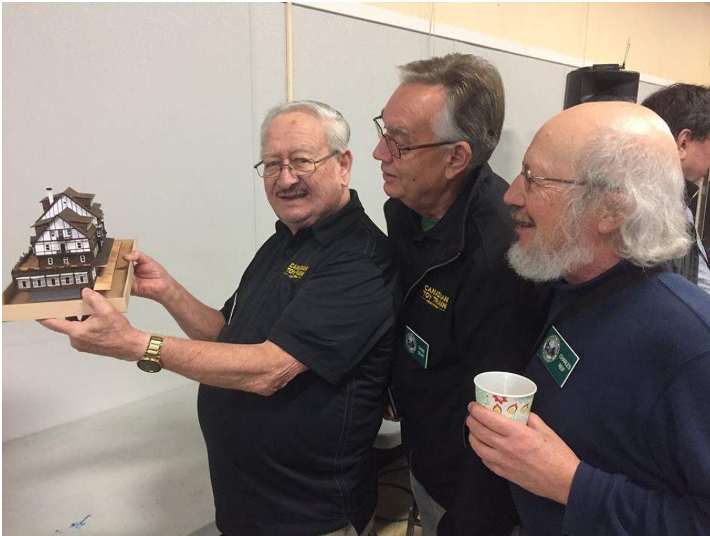
Sicamous Station version 1 – this in N scale. Featured in the Jan 2018 issue.