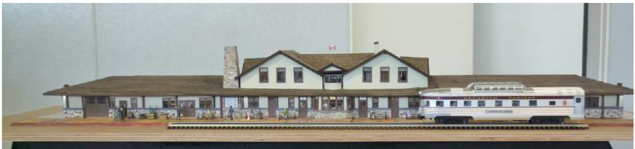
O scale Banff Station, featured in November 2019 issue.

Jorge's models were true works of art. Exquisitely crafted and masterfully detailed, each of Jorge's station models featured a removable roof that allowed the viewer to peer inside the station, revealing the detailed interiors, all built true to original floor plans, and always featuring the requisite washroom and toilet! His roofs were assembled shingle by shingle, and each station had all the exterior features – including fire escapes – found on the real Railway Stations.