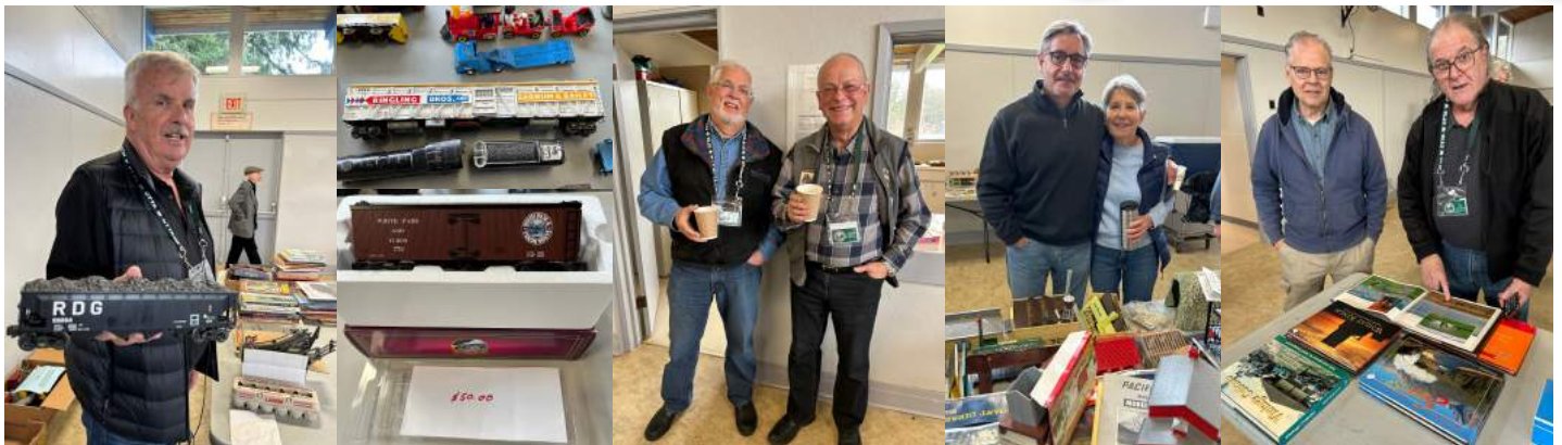
No wind, snow or sleet deterred us from our appointed meeting.