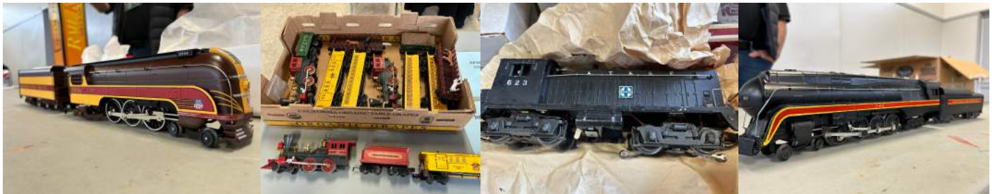
A number of interesting trains were seeking buyers, from General sets to a 746 NSW short stripe northern.