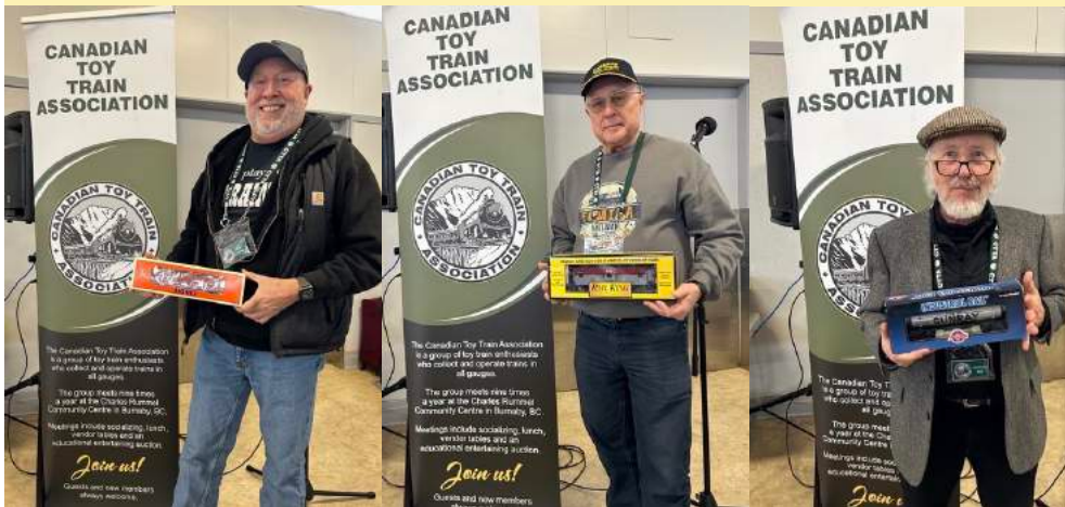
March Door Prize Winners