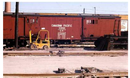
26477 CPR HORSE CAR #272007 AGINCOURT ONT. SEPT. 1969