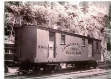
Photo: Canadian Pacific Railway Mail Car No. 1 at Yale, 1884. Revelstoke Railway Museum Collection, P-3502.