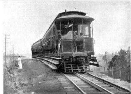
FROM ORIGINATOR OF A 3-RAIL O-GAUGE AND HO-GAUGE SYSTEM AT FULL SCALE. ENTER RAIL REPRODUCTION OUTSIDE OF THE NEW YORK, NEW HAVEN AND HARTFORD RAILROAD.

Yep, never let 'em tell ya it ain't prototypical... https://www.catskillarchive.com/trextra/3rail.html