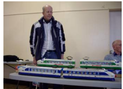
remembering Mike Brown: a 2009 "show n' tell" of big Japanese tin litho trains.