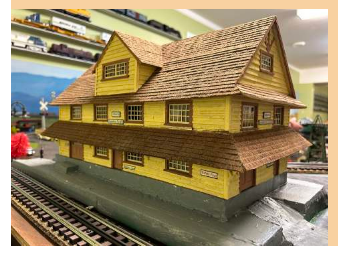
Scratch-built structures are a feature.