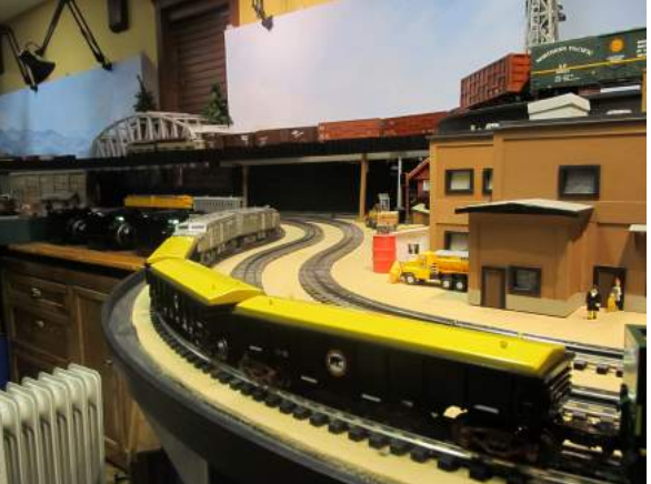
Ken Locksley used scrap bits from Jim Sutherland's sign shop to make these Algoma Central covered gondola cars.