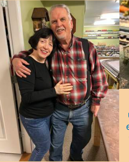
Reconstruction underway on one end of the layout, watched over by Mt. Baker.