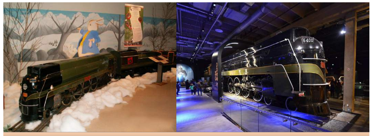
Eaton's Christmas ride-on train 1940's/50's in Toronto. Where is it now?