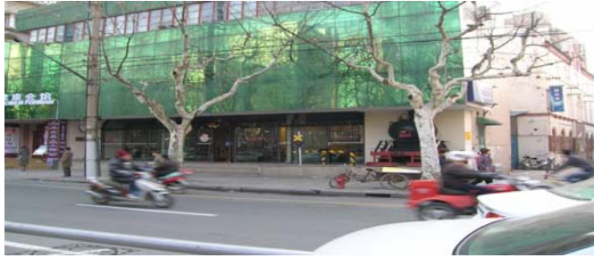
A Shanghai Train Station...