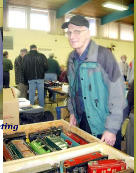
Photos from the December Club Meeting