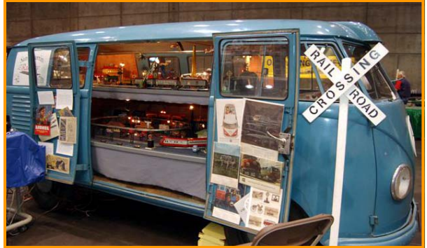
You Should Go .. to the next TTOS National Convention: