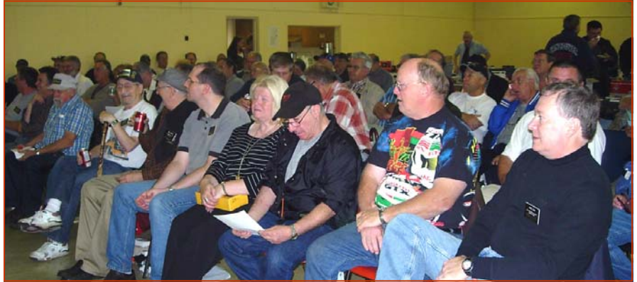
Record Attendance at 2007 AGM of the TTOS Canadian Division.... More than 90 members & guests were in attendance