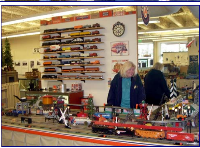
TTOS Canadian Flyer May 2007