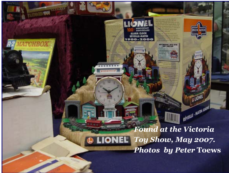
Found at the Victoria Toy Show, May 2007.