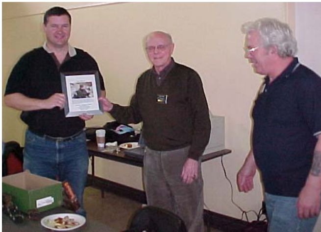
Every one had a dog gone good time at the March meet-