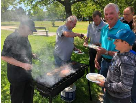
BBQ TIME at the June meeting. and Strawberry Shortcake!