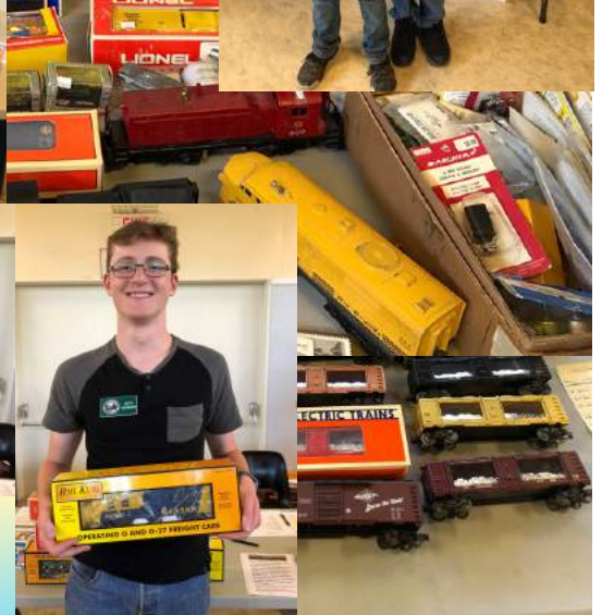
Happy Sad Angry incentive draw/ door prize winners.