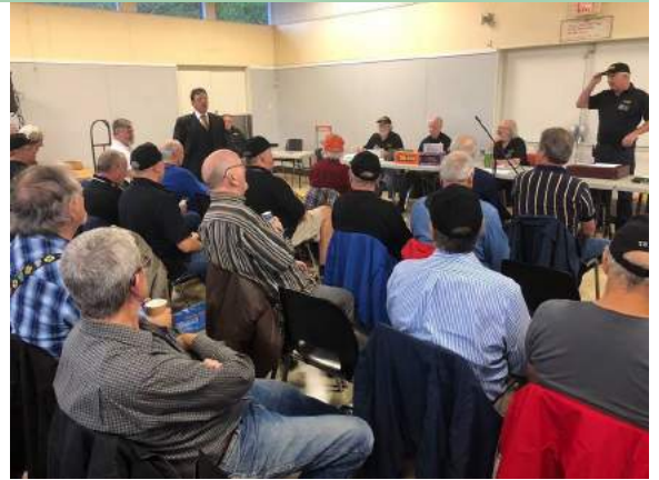
CTTA Annual General Meeting in full swing