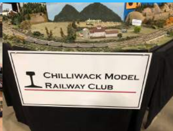
Lots of other clubs with layouts of many scales. Our club members there with trains to sell. Some Favourite locos.