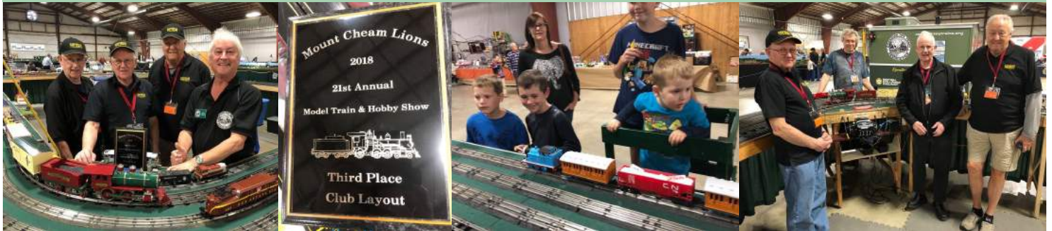
Mt. Cheam Lions — our layout is a star! bravo to the layout crew, well done.