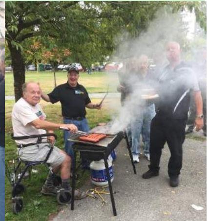
another successful BBQ... er, AGM