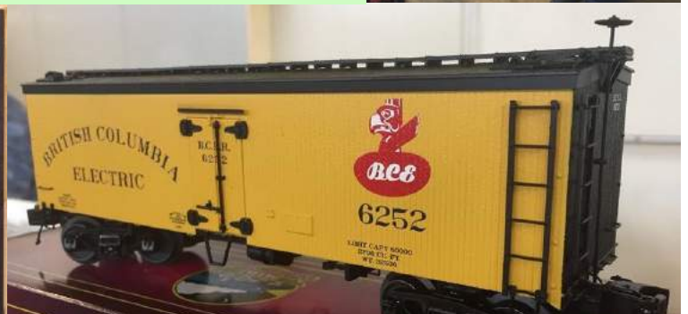
LATEST CLUB CAR BC ELECTRIC THUNDERBIRD REEFER