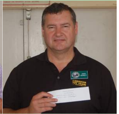
September Door Prize Winners