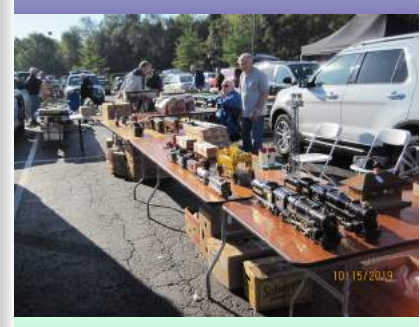
At the so-called Holidome ballroom, extra rooms and parking lot Mon-Wed.