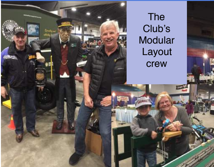
The Club's Modular Layout crew