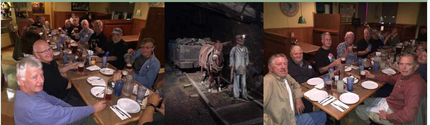
Yorkistas relaxing after a hard day at the coal mine. Its rough, I tell ya'