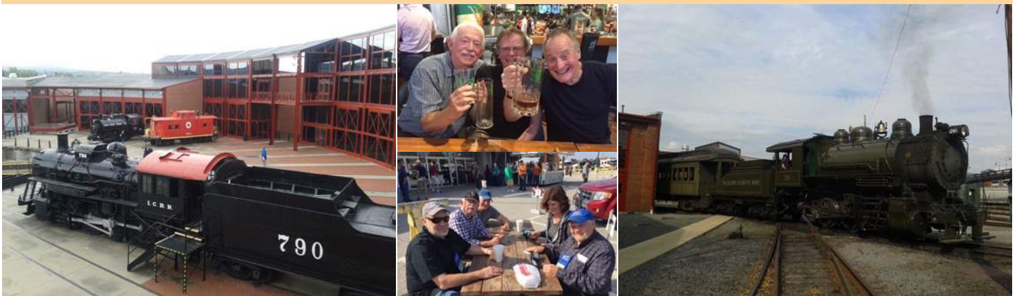
More Steamtown Scranton PA train pix