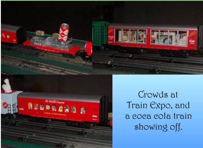
Crowds at Train Expo, and a coca cola train showing off.