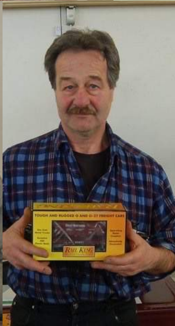
APRIL DOOR WINNERS