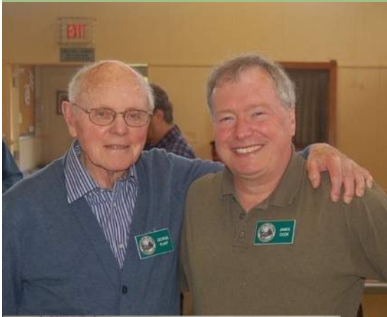
OLD FRIENDS & OLD TRAINS