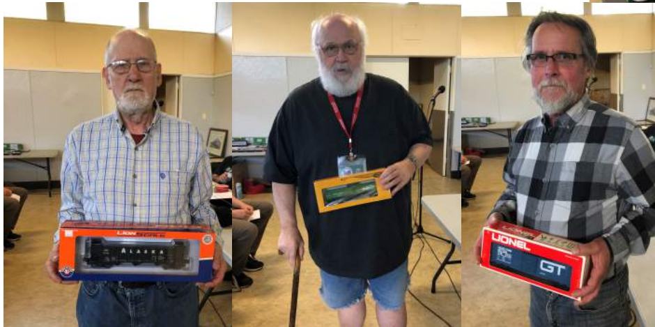
APRIL DOOR PRIZE WINNERS