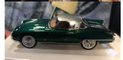
and a picture of the very very rare original!