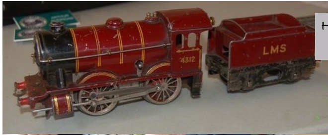
Hornby O gauge prewar mechanical locos