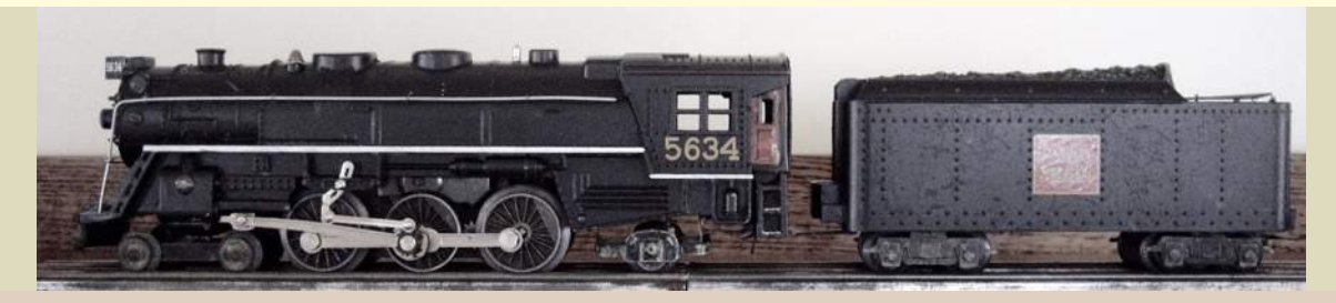
A CN pacífic. by charles reif working with a marx 333, with a closed cab added, CN style handrails and number board. matching all-green coaches by marx too.