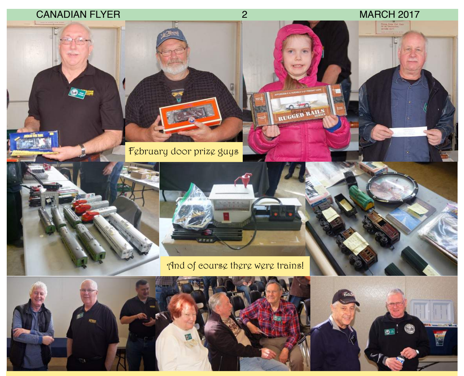
February Meeting — a good day for old friends, and new friends