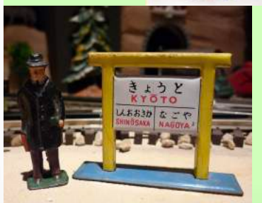
Japanese person with destination sign