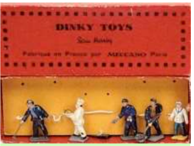
Hornby Dinky Toys English people Hornby French people