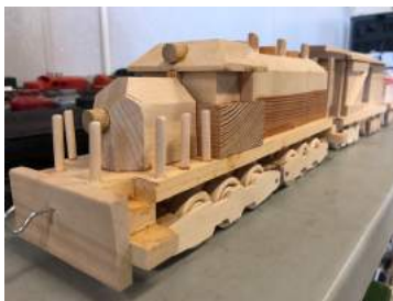
Yes its Wooden!