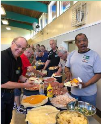
Food for thought