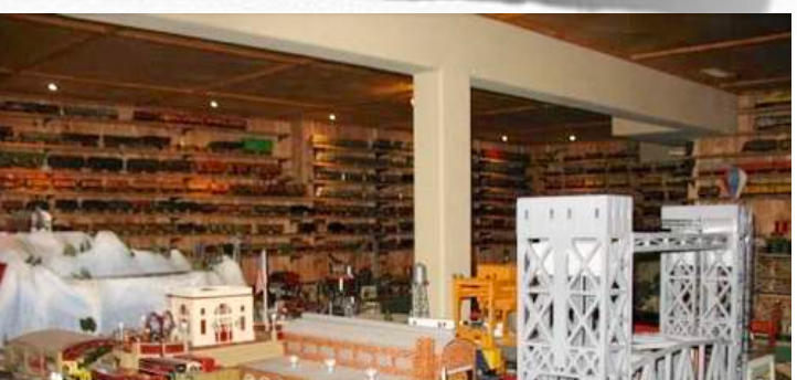
How many lives has this layout had now?