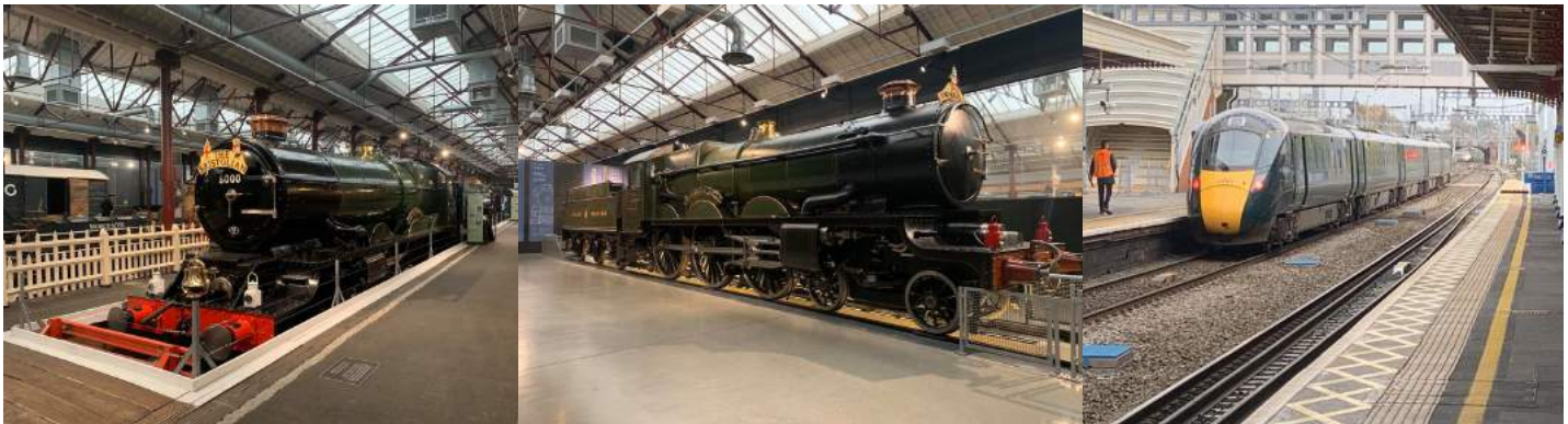
CTTA New York member Ralph Spielman sends a pair of photos from the Great Western Railway museum in Swindon in the UK, plus a shot of the modern stuff at Slough. Thanks Ralph. Beautiful.

PS DO YOU HAVE OLD OR FIRST LAYOUT PICTURES FOR AN ARCHIVES FEATURE?