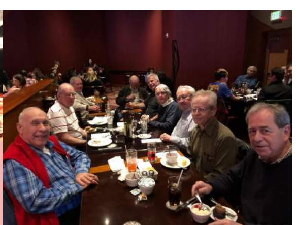
HUNGRY SHOPPERS FULFILLED AT THE CASINO.