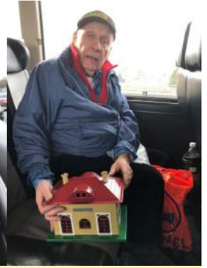
READY TO ROLL AND A BIT OF SHOW 'N TELL