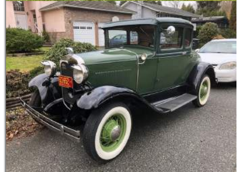
Hot Wheels at November's meet