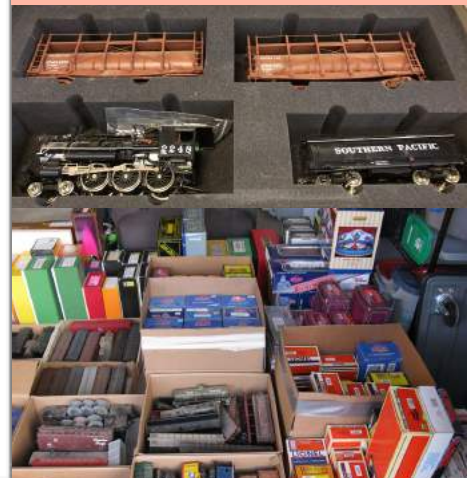
Scale 0 from Jim Flett's estate: (more coming to January meet)