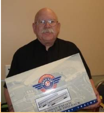
More from COOTS' Dec. 7 meet in Nanaimo