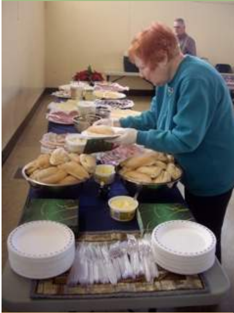
Last meet of 2014