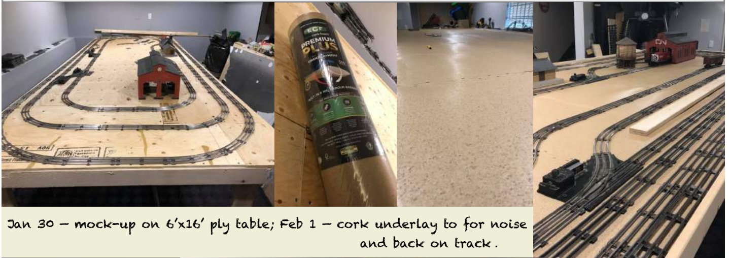
Jan 30 – mock-up on 6'x16' ply table; Feb 1 – cork underlay to for noise and back on track.

Mike says: One end of upper dog bone will be the subdivision the other end will have a ranch backing onto a forest the back of the mountain will be a rock quarry. (stay tuned.)