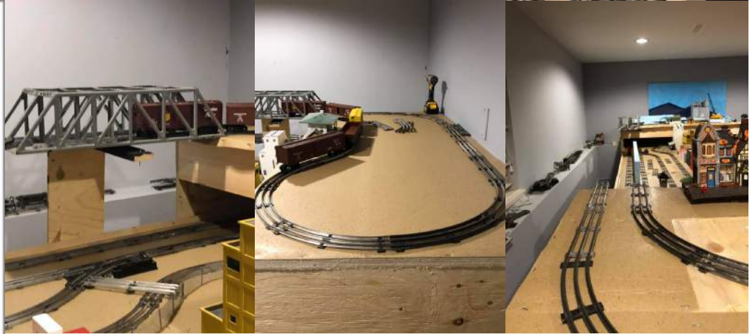
Feb 2 right raised dog-bone

Mike says: One end of upper dog bone will be the subdivision the other end will have a ranch backing onto a forest the back of the mountain will be a rock quarry. (stay tuned.)