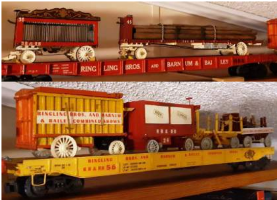
John Black posted pictures of some of the Circus Train he acquired from the Jim Flett estate. what a train!