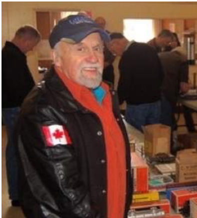
FOUNDING MEMBER #1 TTOS CANADIAN DIVISION