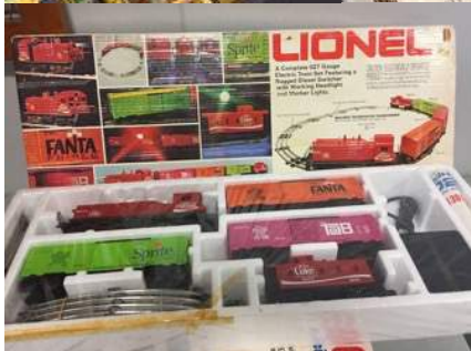
Lots of Trains and Layout Goodies —

from Dinky cars to Lionel prewar, postwar and MPC, to a beautiful fine scale O gauge brass train.