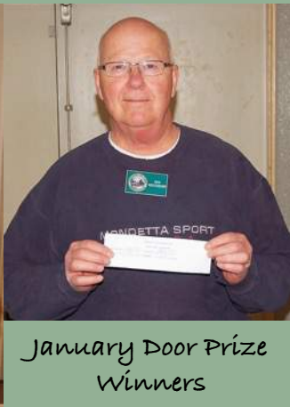
January Door Prize Winners