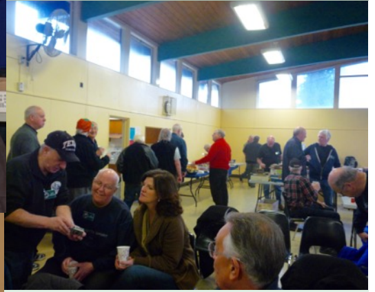
JANUARY 2016 MEETING