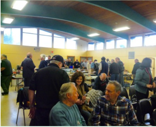
HAPPY NEW YEAR!