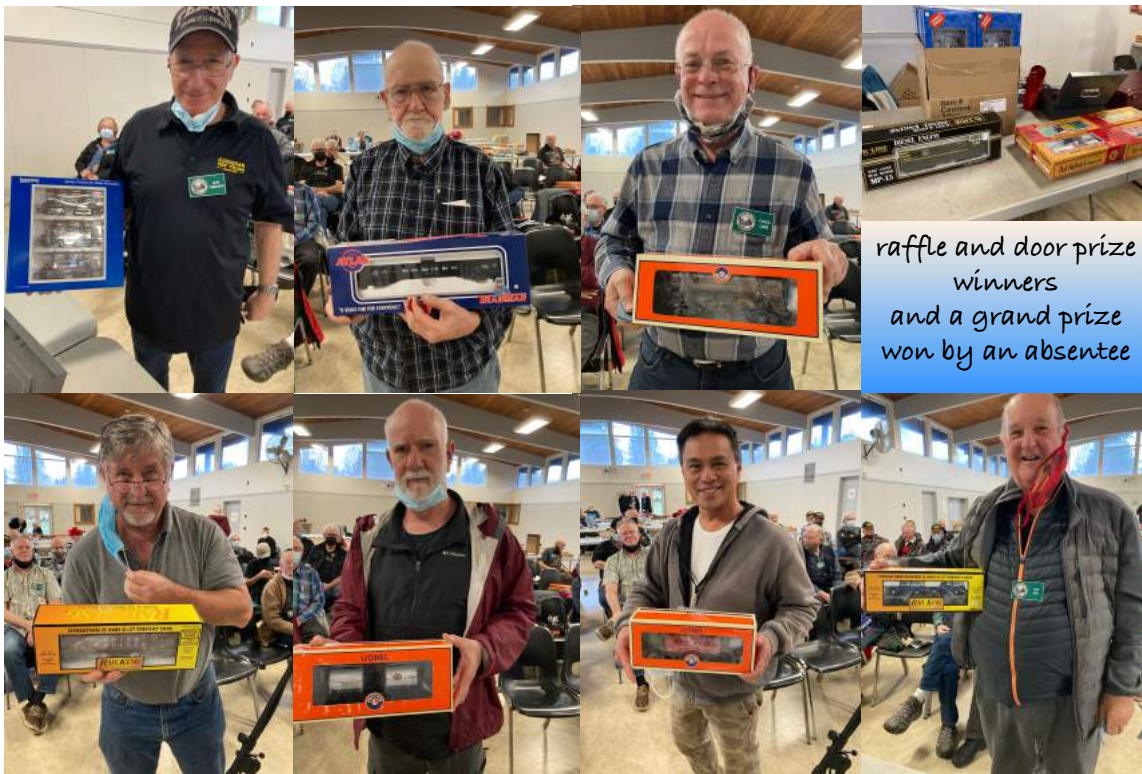
raffle and door prize winners and a grand prize won by an absentee