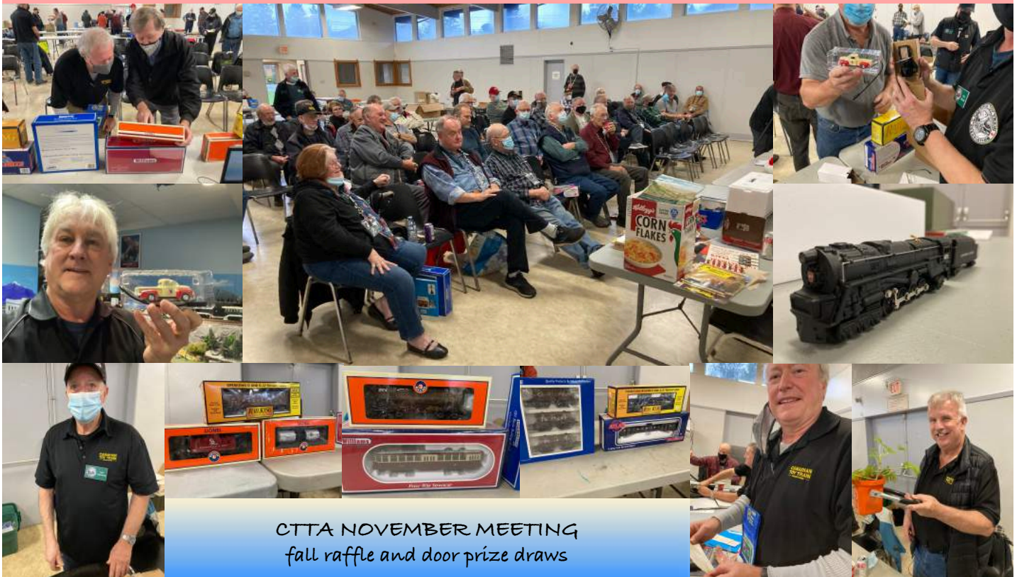
CTTA NOVEMBER MEETING fall raffle and door prize draws