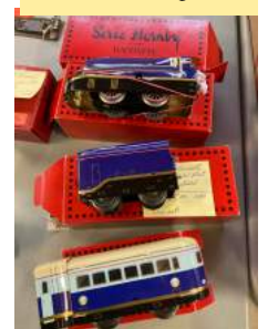
repro French Hornby