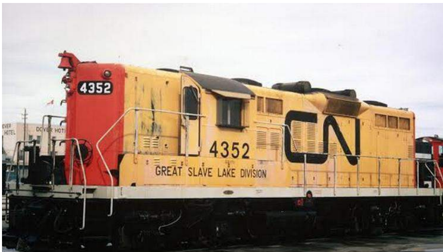
ANOTHER YELLOW AND RED LOCO...

53101 CNR EMD GP9 #4352 EDMONTON ALTA. SEPT. 1969