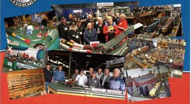
TrainWorld April 2 at 11:18 AM

Canadian Toy Train Association Vancouver, BC Canada