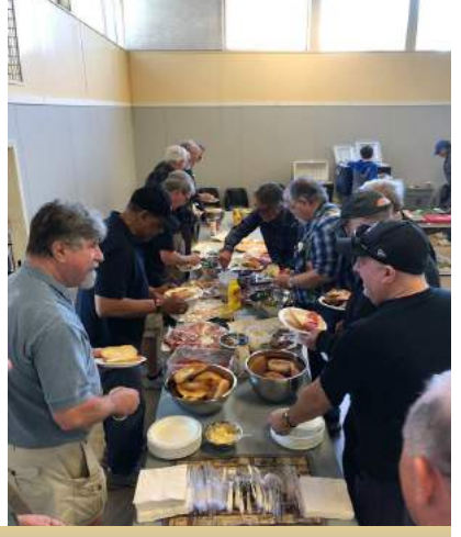
FOOD OF COURSE!