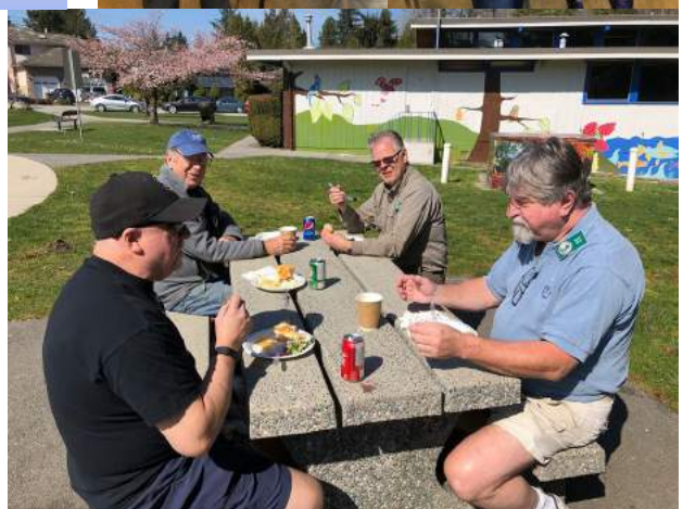
LATE MARCH ON THE WEST COAST!