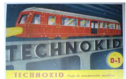
Above and Below: Hungarian Train Box Art