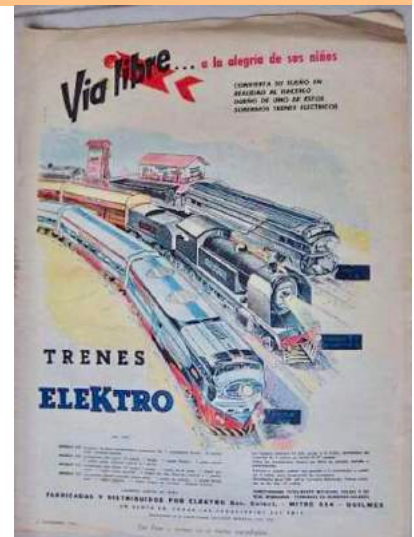
Above: South American Train Ad