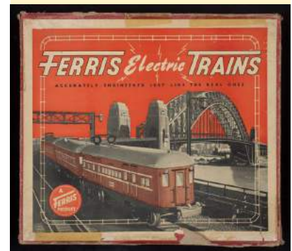
Below: Australian Train Box Art