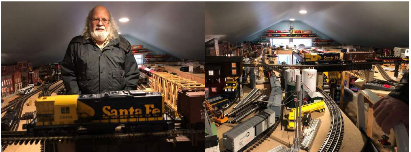
Layout Corner: Tom Modica bestrides his attic empire. SANTA FE, EH? centre below: MTH Lighted fueling station

PS DO YOU HAVE FIRST TRAIN OR FIRST LAYOUT PICTURES FOR AN ARCHIVES FEATURE? SEND TO EDITOR!