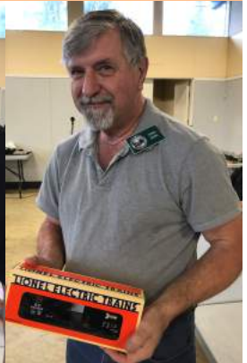
February door prize winners