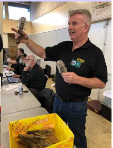
Is it? Or isn't it?... ...Original? fun to see in any case.